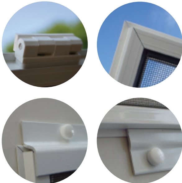
Top and bottom bracket for lift-out screen